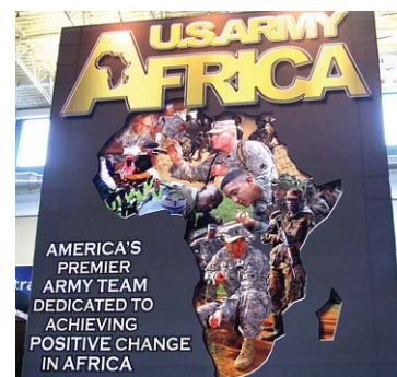
A US Army Africa exhibit. This is the army component of the United States Africa Command (AFRICOM).

Center for Policy Research and Dialogue, PO Box 24721/1000, Addis Ababa, Ethiopia T +251 1 614649 F +251 1 637674 cprd@ethionet.et www.cprdhorn.org